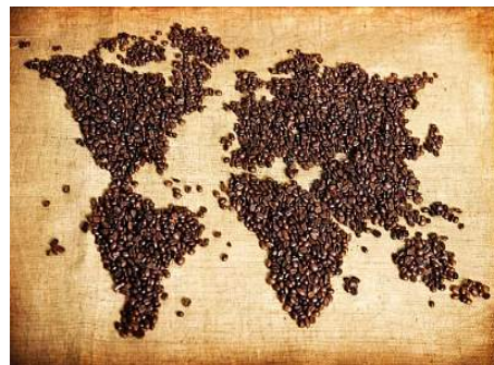
According to the man in the pub, Sheppey Sheep Droppings were sent all over the world. However, we do not know if anyone ever ate them!