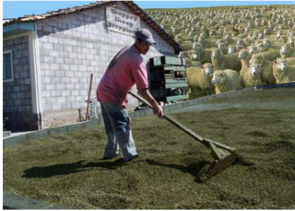
Sheep Droppings were collected and air dried if there was a sunny day on Sheppey.