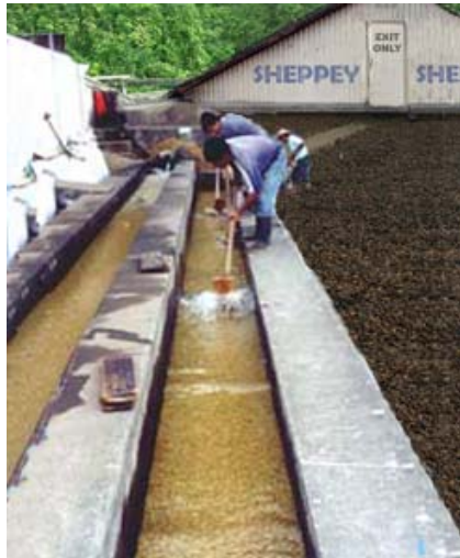
The droppings were then expertly washed by highly trained and diligent workers. The process was known as 'Poo Washing'.