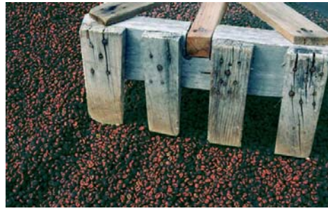
They were sometimes raked using a cheap old wooden rake.