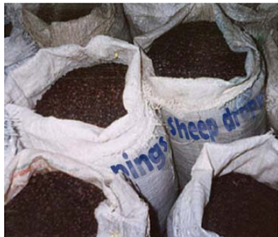
When dry, the droppings were then put in sacks ready for sending to the public